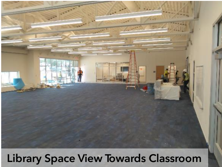
Library Space View Towards Classroom