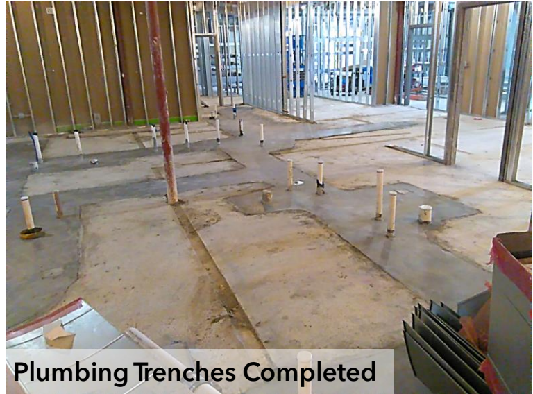
Plumbing Trenches Completed