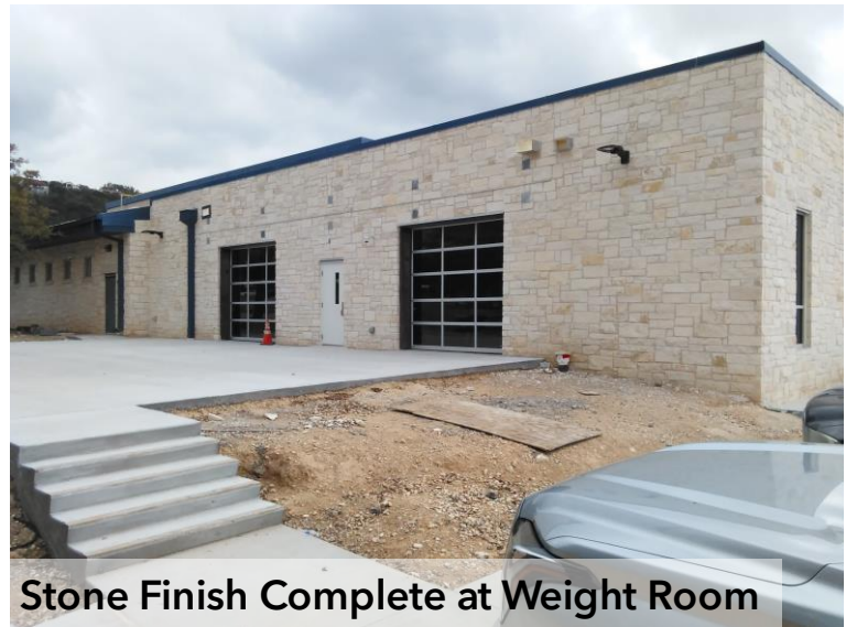
Stone Finish Complete at Weight Room