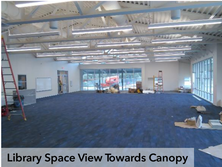
Library Space View Towards Canopy