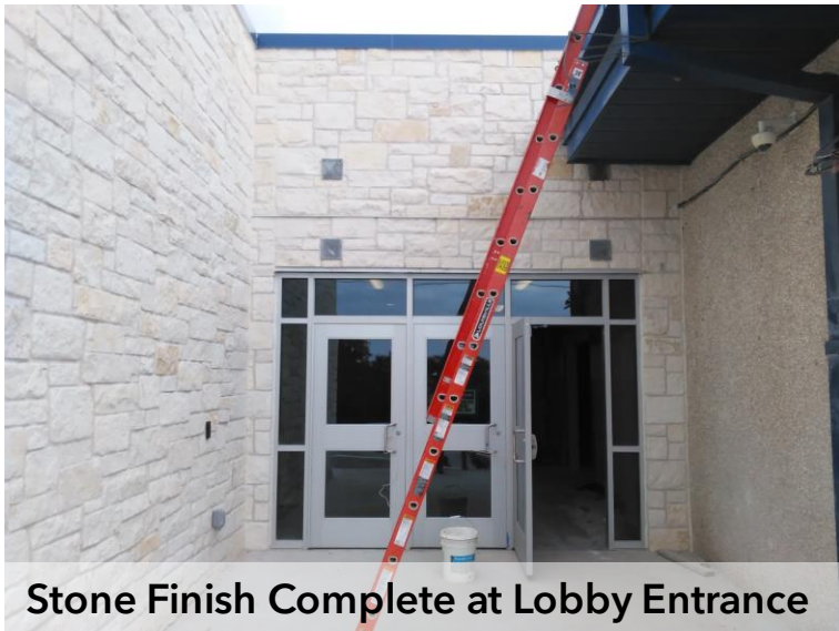
Stone Finish Complete at Lobby Entrance